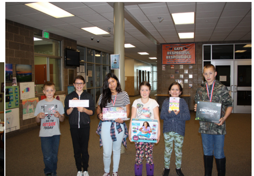
Mustang Club Winners