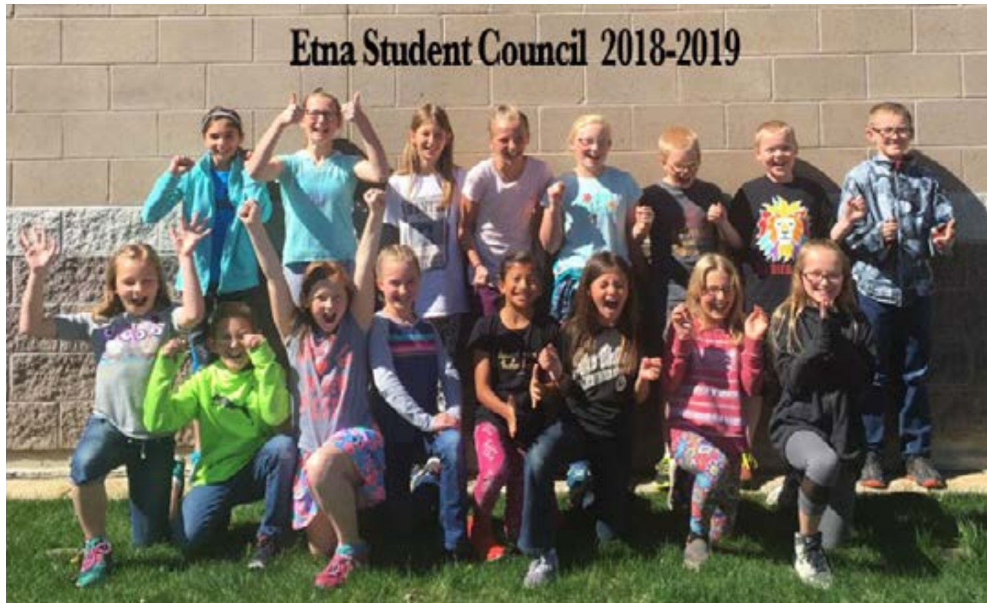
Etna Student Council 2018-2019

These students are delighted to hear they have been selected to be members of next year's Etna Elementary Student Council. They will do a great job!