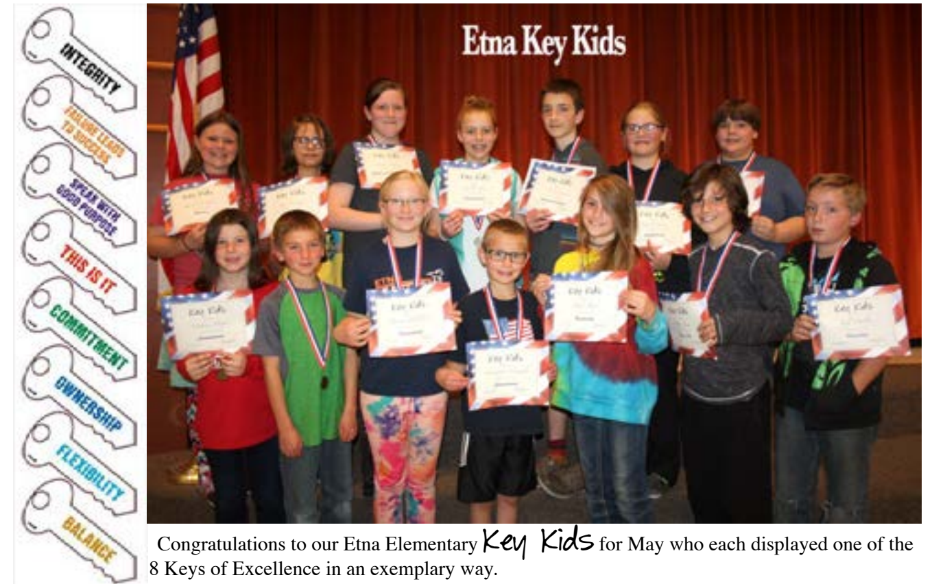
Congratulations to our Etna Elementary Key Kids for May who each displayed one of the 8 Keys of Excellence in an exemplary way.