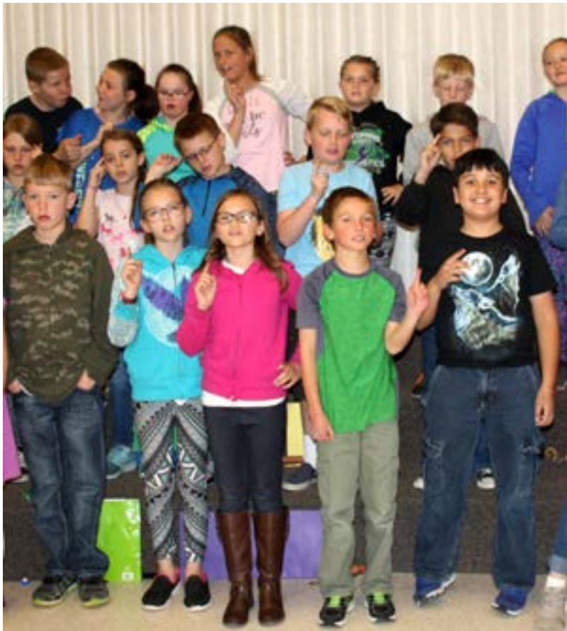
4th Graders practicing for their April concert. All performers did a great job!