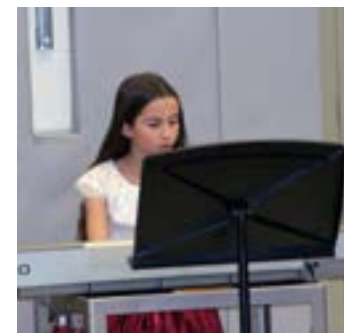
6th Grade Play 2017