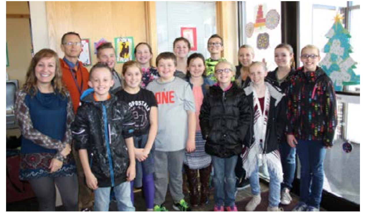
EES Student Council members had a great time trimming the Wells Fargo Bank walls with homemade Christmas decorations made by our students.