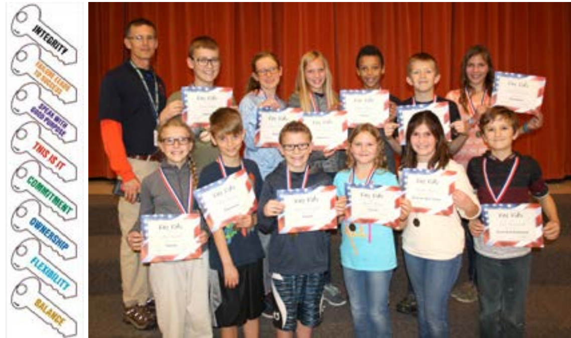
Congratulations to our Etna Elementary Key Kids for December who each displayed one of the 8 Keys of Excellence in an exemplary way.