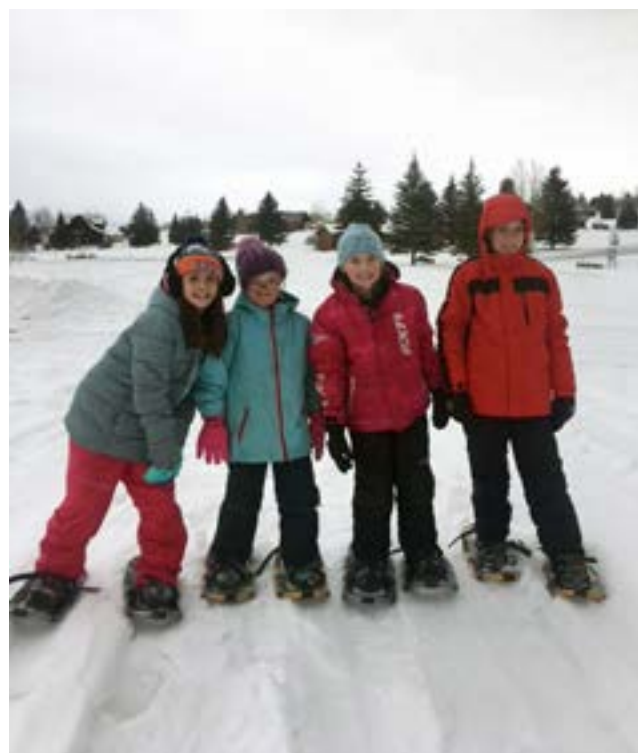
The cross-country skiing/snowshoeing enrichment class was great fun!